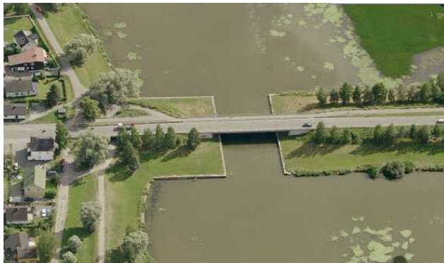
Picture left: Nybrua, the bridge that connect Strømmen and Lillestrøm

The history starts about hundred years after Strømmen, when the dampkraft came to Norway. Today there is almost 15.000 inhabitants and a selection og shops, bars, schools and one of the the largest mess in the country.